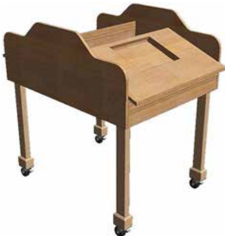
Tablet Table for Kids: $300