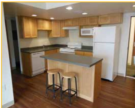
Iowa State University Fredrickson Court cabinets