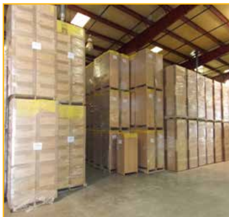
Dorm furniture stacked and awaiting delivery