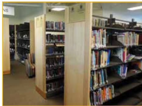
The North Liberty Community Library features a new shelving line from Metal Furniture (above) and the new Alexander Chairs from Panels & Seating (below).

truly welcoming and unique experience for its library patrons.