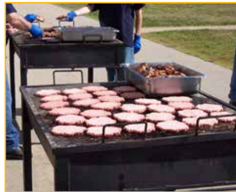
The great food and ice-cold refreshments provided relief from a hot day.