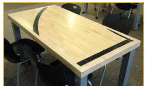
Custom table made from recovered gym flooring.

Next time you see them, of course the proper response would be “RRRRRRRRR”. Thanks guys!