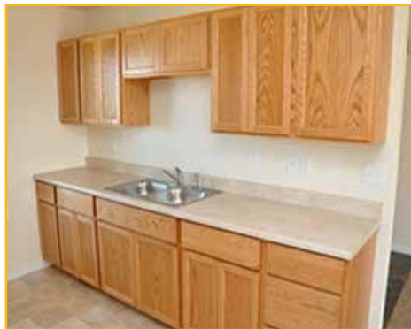
Sample Habitat for Humanity cabinets

In addition to our cabinets, IPI-Fort Madison produced and delivered 10,264 pieces of dorm furniture this summer for Iowa State University, University of Iowa, University of Northern Iowa, Iowa Western Community College, and Grand View University.