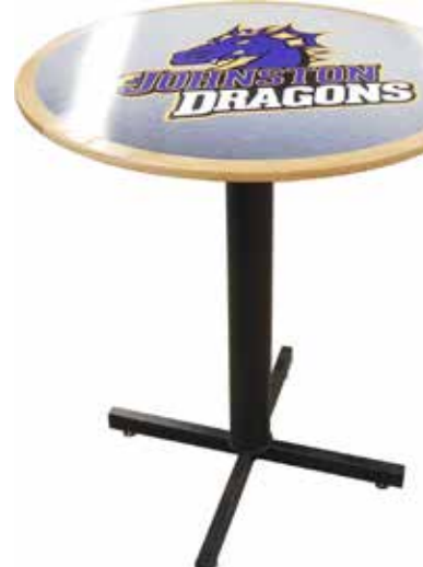
Logo Pedestal Tables

Designed for schools but applicable to any organization wanting to show off their brand, IPI's new Logo Pedestal Tables feature a cafe height base. The customer's logo is printed in the Sign Shop and affixed to a laminate table top with wood edging. They are now available for $349 from Custom Wood.