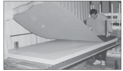
Inmates carefully place a sheet of laminate on a pre-glued sheet of particleboard.

glued. Inmates place the glued board onto a sheet of backer and then a piece of laminate is applied on the top. When twenty boards are complete, the stack is rolled into a press where it remains for at least an hour, ensuring the laminate and backer are both properly adhered. The stack is then rolled out and picked up with a forklift and left to sit for 24 hours before cutting the boards to size.