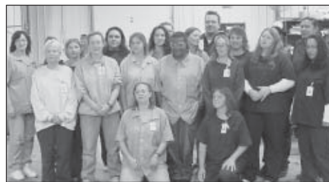
Tom Arnold took the time to pose for group photos with the inmate employees at Mitchellville.

by the actor and sports show host, Tom Arnold. Tom Arnold and a TV crew from his TV show, "The Best Damn Sports Show Period," visited the shop and spent time