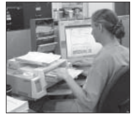
An inmate scans a document for archiving in Imaging.