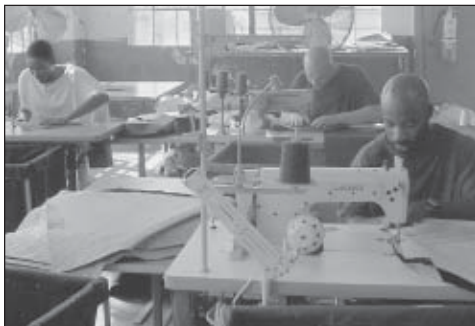
Inmates work on jean jacket production.

Fort Madison sold 10,000 pairs of jeans to the institutions last fiscal year with only 20 returned for rework, which is remarkable. We expect to double the quantity sold this year since most of the institutions are now purchasing their jeans from IPI. Quality and service is very important and Fort Madison continues to improve in these areas.