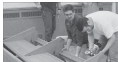
Moving & Installation tore down, helped load and then reinstalled all the finished pews at St. Theresa.

As we build upon the experience and success of these projects and remain dedicated to our mission of providing Exceptional Service, Reasonable Prices & Quality Products, we can become as successful in this market as we have with schools and universities in Iowa.