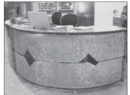
Swirled Steel Workstations, UNI

Trivia Challenge Answers: 1. 12 literary Brailleists; 2. 36%; 3. Kent Ashline; 4. 10,000 pairs; 5. Mike O'Brien; 6. Mitchellville Printing; 7. Bob Manka (FM); 8. 125 pews