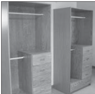
Combination Wardrobe-Chests, ISU

With all of the dorm furniture installations at the various colleges and universities across the State of Iowa, Iowa Prison Industries had developed a number of new items to meet the needs