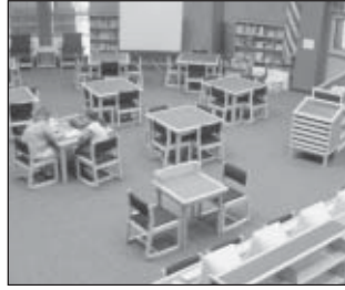
Summit Middle School Library

Johnston. Johnston Community Schools has been a supporter of Iowa Prison Industries for several years and turned to IPI for many of the school furnishings needed for the new school. IPI's ability to produce custom metal and wood products was extremely important to this project. IPI produced custom school desks, library tables,