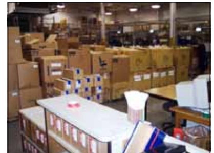
Canteen offenders assembled 12,000 gift bags this holiday season.