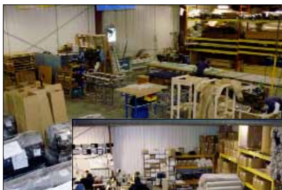
Mitchellville Panels & Seating

We've come a long way at IPI Mitchellville, and we would like to go a lot farther. Our biggest challenge for the coming fiscal year: making space to accommodate new products and new businesses!