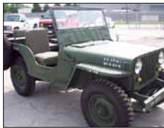
1953 Willys Jeep after restoration.

Some of the other projects Rockwell City has been working on are Military Vehicles. Federal Surplus acquired two old military vehicles. One is a 1953 Willys