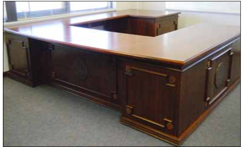
IPI Fort Madison continues to produce beautiful custom wood pieces such as this desk designed and built for the Iowa National Guard.

us to set up our production shops in the most efficient manner. The building is old, drafty and would need a complete makeover. With the new building, we