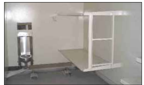
Inside & outside views of the jail pods.