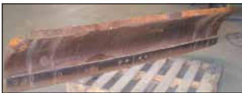
Snow plows before & after.

Following the DOT's approval, the equipment is then disassembled, sandblasted, repaired, primed and