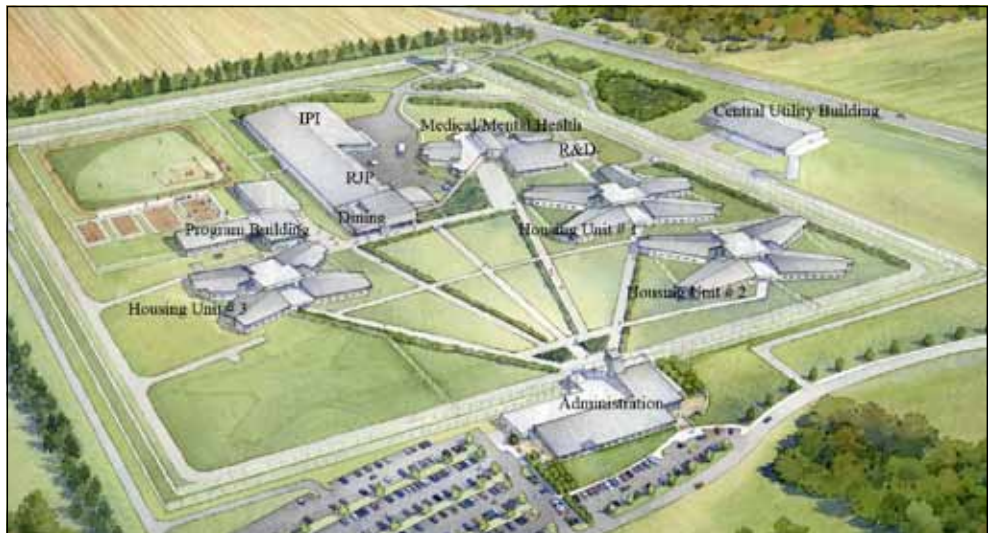
IPI Fort Madison is looking forward to having a new building at the new prison.

will be able to set up to allow an efficient production flow starting with raw material to our finished product to delivery to the warehouses for customer delivery.