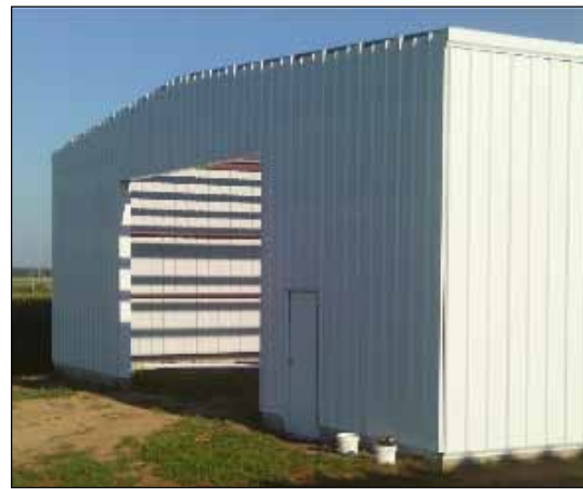
Inmates constructed this new building at Newton for equipment and hay storage.

Since 2006 IPI Farms have provided 71,855 inmate training hours!