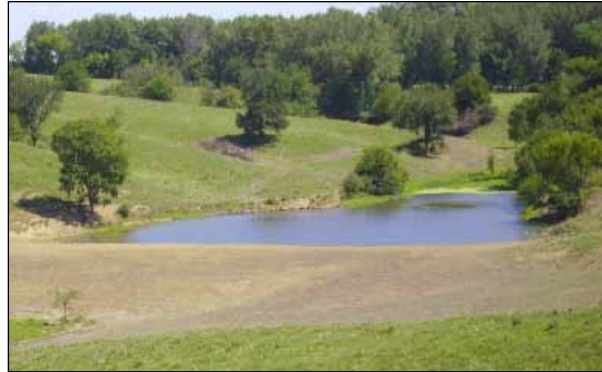
Pond repaired near the Dairy Barn farm location in Anamosa.