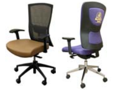
The Jaguar (left) and the Track (right, UNI embroidery) are two of the new additions to the seating department!

Always looking into new markets and training to stay competitive, the Seating department is preparing to introduce three new lines of chairs: the Austin, the Jaguar and the Track. Vendor representatives have been on site in the past month to demonstrate how to manufacture all three chairs.