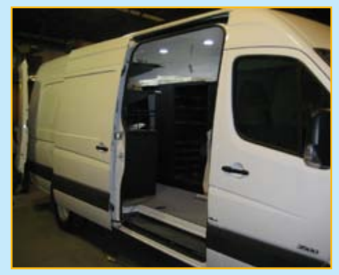
IPI staff and offenders in the Metal Shop welcomed the unique challenge of outfitting the van interiors

Recently, the Iowa Department of Public Safety called on IPI to outfit a pair of response vehicles for their organization. The project presented unique challenges for custom designed cabinetry and storage units. Both staff and offenders met the challenge with great results.