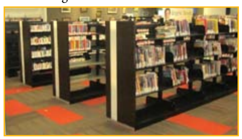
Cedar Rapids Library wood ends and tops completed by Custom Wood

Since we visited them last in 2010, the staff and offenders in Custom Wood have had continued growth.