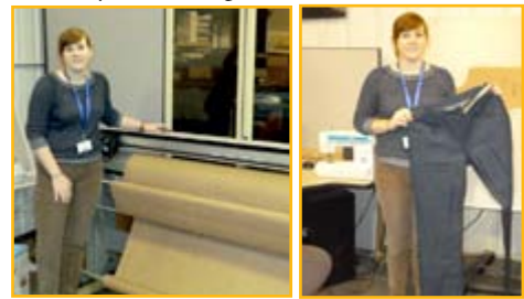
Printing on the IOLINE printer (left), a sample of the redesigned denim jean (right)

proved to be more difficult as she was not able to find a store-bought pattern to start the process. We expect the new jacket designs to be ready for testing this fall.