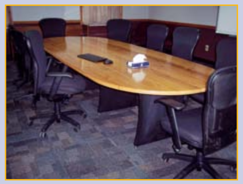
Custom furniture made from reclaimed barnwood

The State Training School For Boys also purchased the showroom sample Eldora conference table for a second conference area with plans to add matching barnwood trim to the room next fiscal year.