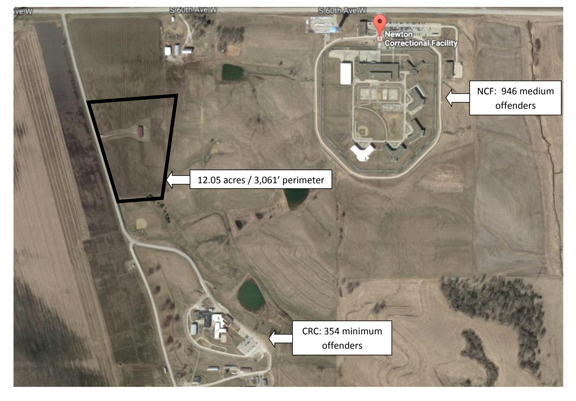
12 Acres Proposed for Newton (SD has 40 sites on 10 acres)